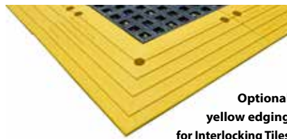
Optional yellow edging for Interlocking Tiles

Improve safety and visibility - optional Safety Yellow ramps, edging, and corners are available for Interlocking Tiles