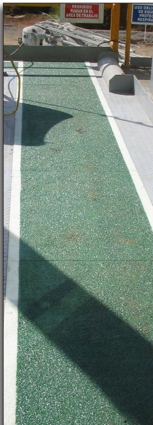
Two tone Hi-Traction® Walkway Cover