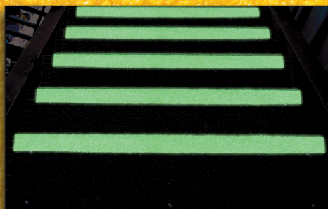
HiGlo-Traction®, Glo Safety Yellow Step Cover (Nighttime)

Pictured: "Standard" Step Cover used on land rigs