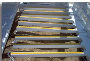
Monkey Board Fingers with HiGlo-Traction®