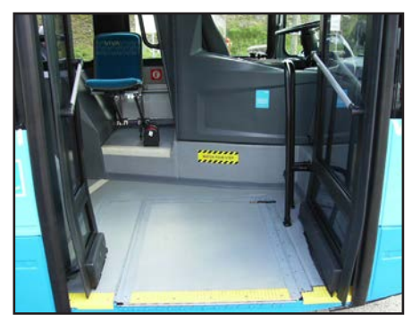
Trim assemblies can be direct gritted to match coach colors

Safeguard's unique Anti-Slip surface is universal, regardless of what it is bonded to. Choose from a variety of base materials of construction depending on your application. Covers are available in Flexible PVC (vinyl), pultruded FRP composite fiberglass, stainless steel or the SAFEGUARD<sup>®</sup> surface can be applied directly to customer supplied material.